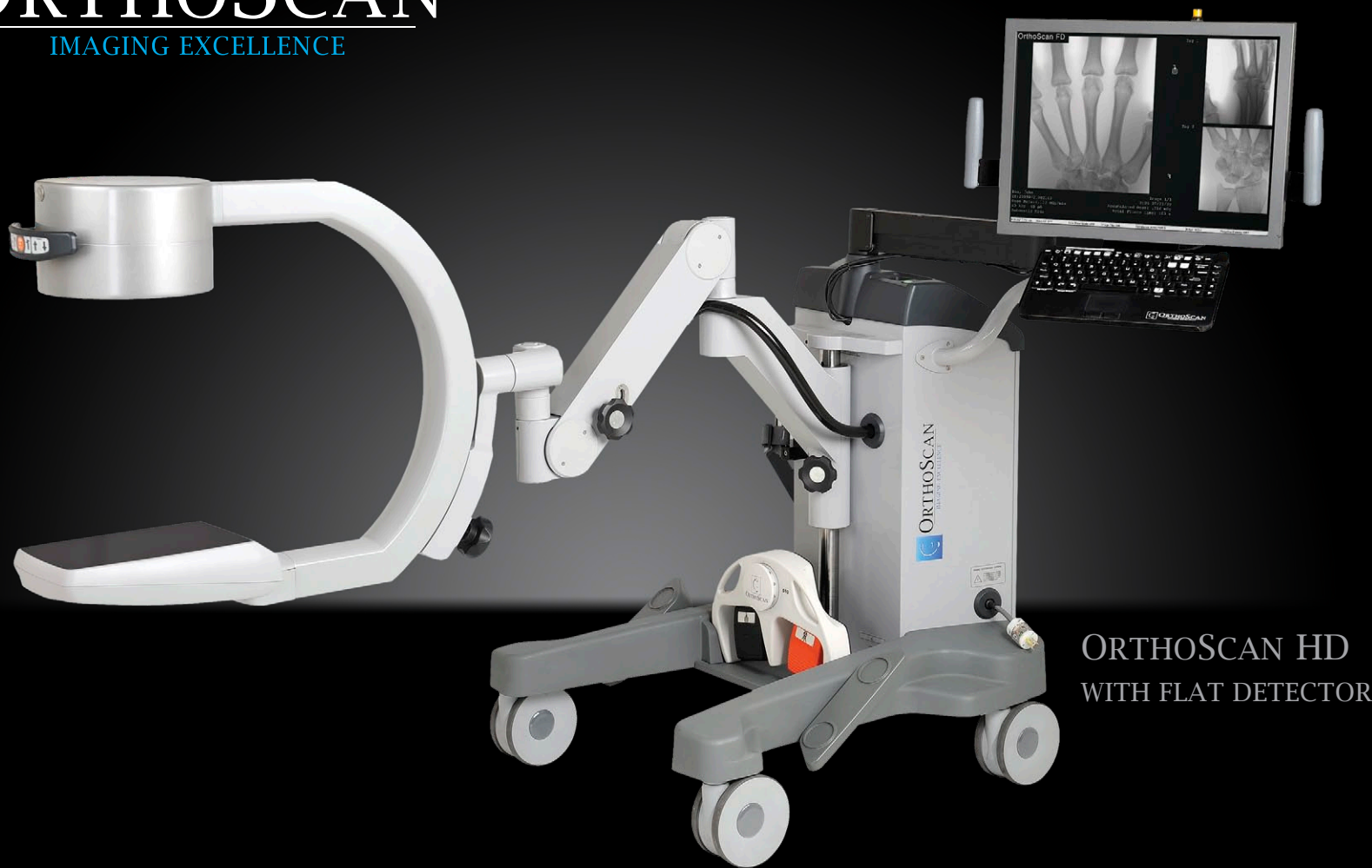
ORTHOscan HD WITH FLAT DETECTOR