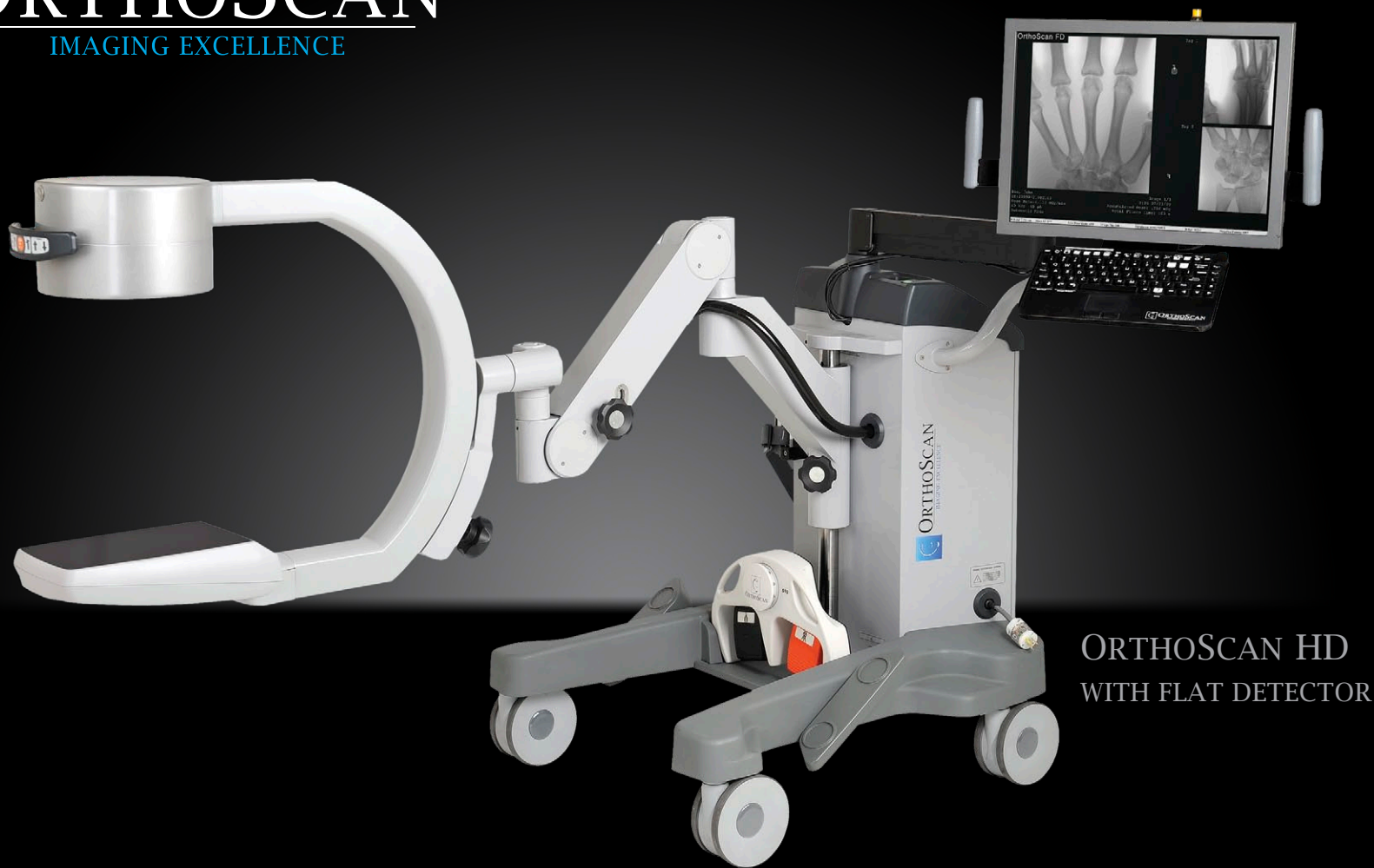
ORTHOscan HD WITH FLAT DETECTOR